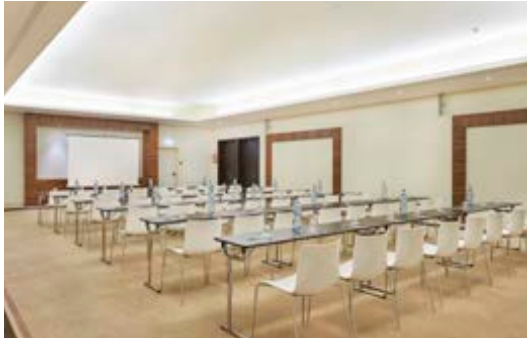
Meeting Room - Lagos