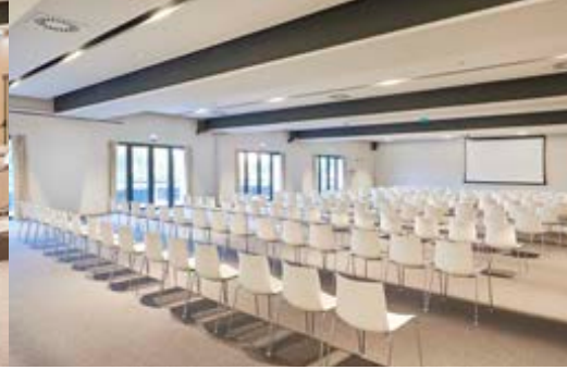
Meeting Room Ceuta 1+2