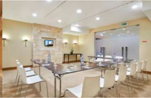
Meeting Room - Macau