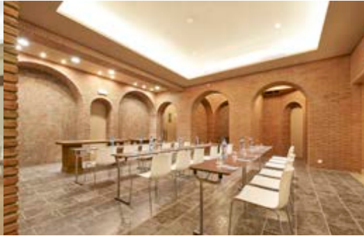
Meeting Room - Goa