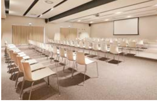
Meeting Room- Ceuta 1