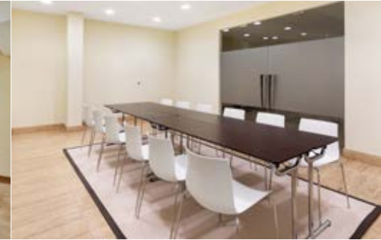
Meeting Room - Baía

Meeting spaces total 618m2 consisting of five rooms and two outdoor areas where it is possible to host a wide range of events, providing a comprehensive set of services and solutions. You can count on the entire dedication of the Cascade Wellness Resort team to respond effectively to your every need and make your event a success.