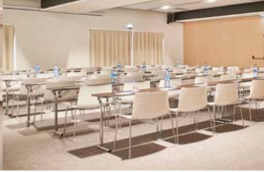
Meeting Room - Ceuta 2